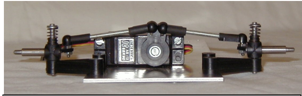
Component assembly for front suspension

Push the stub axles fully into the steering arms and fit over king pins. They should slide easily up and down the king pins, if they don't, remove and rotate the stub axles through 180° and try again. Add the coil springs, M3 washers and the final E-clip on the top. Fix part assembly to the chassis.