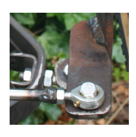
Wheel upright end